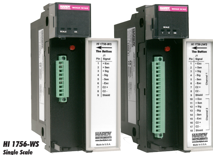
HI 1756-WS Single Scale