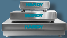
Hardy Bench Scales