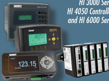
HI 3000 Series HI 4050 Controllers and HI 6000 Series